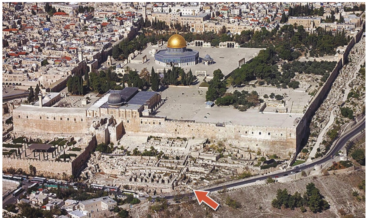
Figure 2. "Looking northwest, this photograph identifies the location of the Ophel site [Jerusalem Archaeological Park] immediately south of the Temple Mount in Jerusalem. The arrow points to Area A2009, where King Hezekiah's and Isaiah's bullae were found."4 The Hebrew word "ophel" is thought to signify a high, fortified place. The park was opened in 2011, following excavations by Eilat Mazar. Some think the ruins of the Ophel were part of a "complex of fortifications that King Solomon constructed in Jerusalem: '...until he had made an end of building his own house, and the house of the Lord, and the wall of Jerusalem round about."5