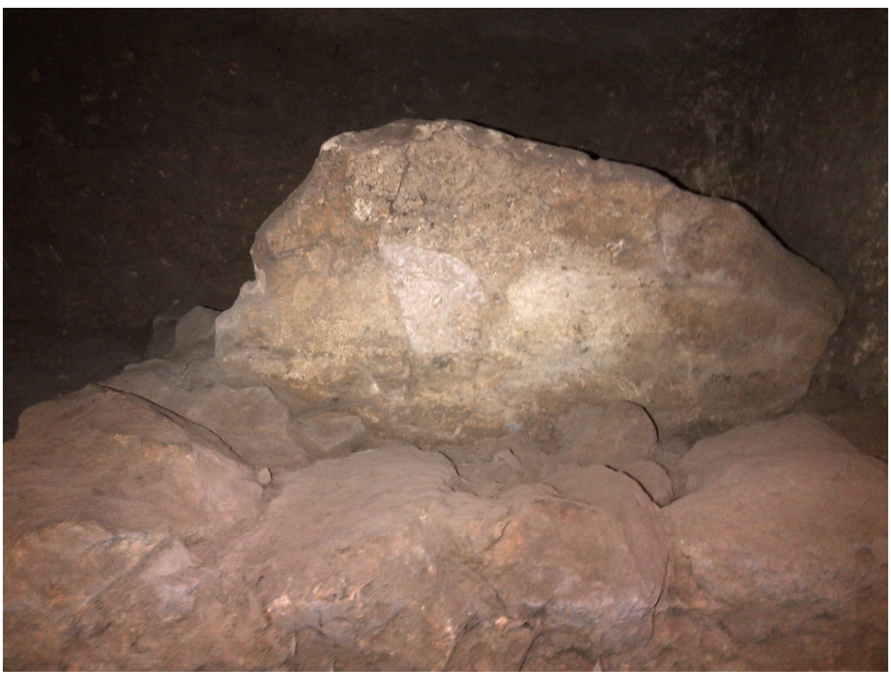
Figure 12. Matzevah18 (Hebrew "pillar") mounted in a base of twelve stones found at the worship site19

A natural stone pillar, similar to the one erected by Jacob,20 was set in a base of twelve smaller stones.