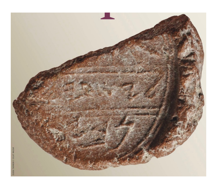
Figure 3. "[Although] questions still remain about what [this bulla] actually says, ... the close relationship between Isaiah and King Hezekiah, as described in the Bible, and the fact that the bulla was found next to one bearing the name of Hezekiah seem to leave open the possibility that ... this may have been an impression of Isaiah the prophet, adviser to King Hezekiah."6 By following Isaiah's counsel, Hezekiah and his people largely avoided the heavy destruction that the Assyrians inflicted on the northern kingdom of Israel.