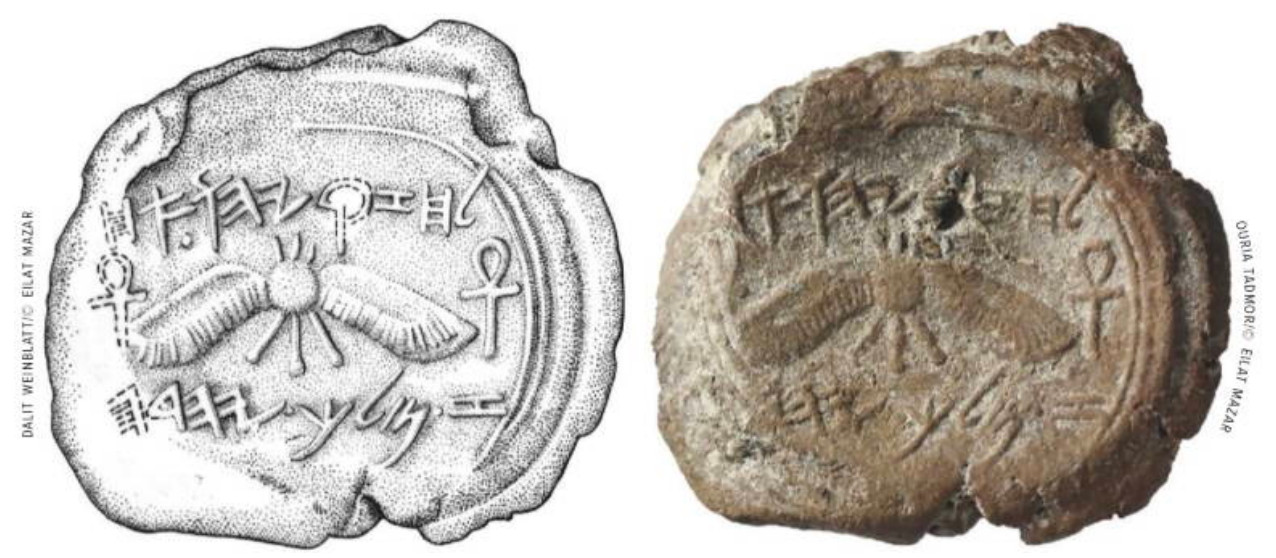
Figure 1. "King Hezekiah's seal impression (bulla) mentions his name and the name of his father, Ahaz, in the upper register, as well as Hezekiah's title as king of Judah in the lower register. The symbol of the [Assyrian] two-winged sun disk[, associated with royalty,]2 flanked on both sides by an [Egyptian] ankh[, a symbol of life,] extends over the full length of the bulla's central part."3

An Old Testament KnoWhy1 relating to the reading assignment for Gospel Doctrine Lesson 30: "Come to the House of the Lord" (2 Chronicles 29-30; 32; 34) (JBOTL30A)