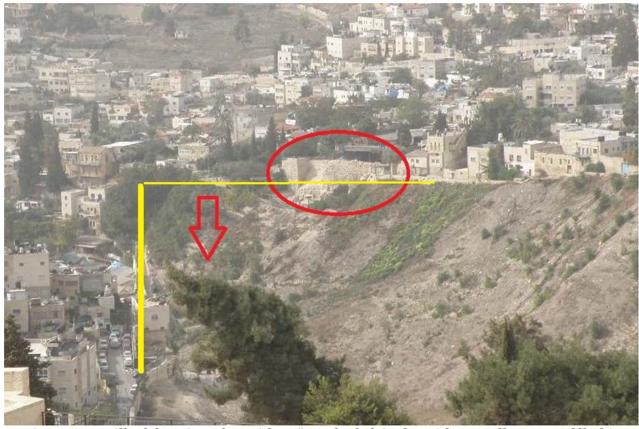
Figure 10. Hill of the City of David.16 "On the left is the Kidron valley, now filled in with the rubble of destruction and centuries of erosion and dust storms. Circled on top of the hill is the 'stepped stone structure,' thought to be an ancient retaining wall. The building to the right of the circle is the City of David Museum. The arrow points to the location of the worship site found underground. The Gihon Spring is adjacent to this area."

Of equal, or perhaps greater, importance is the surprising discovery of a sacred site adjacent to the Gihon Spring. There is evidence that the area was used anciently for animal sacrifice and other forms of ritual and worship.