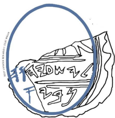
Figure 4. "The Isaiah bulla's top register show the [legs] of a grazing doe[, a symbol of blessing]. It's middle register reads, leyesha'yah[u], which means "[belonging] to Yesha'yah[u]"; the anglicized name of Yesha'yahu is Isaiah. The register's damaged left end probably original included the Hebrew letter vav (the "[u]" of "Yesha'yah[u]"), and perhaps a heh ("h"), which would have served as the definite article {"the") for the following word. The word nvy appears in the lower register. If the Hebrew letter aleph were added to the end of the word, at the bulla's damaged left end, the word would then read nvy', which signifies a "prophet" in Hebrew. This would strongly suggest that the bulla belonged to the prophet Isaiah." Alternatively, if the Hebrew letter aleph was not originally at the end of the word nvy, the word would have likely been the personal name of Yesha'yahu's father (i.e., "Nvy") rather than a title (i.e., "prophet").