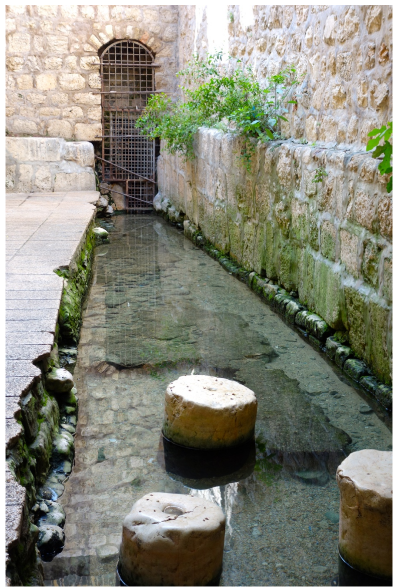
Figure 9. Pool of Siloam.13 The pool is at the site where Jesus told the blind man to wash his eyes, after having anointed them with clay and spittle (John 9:6-11)