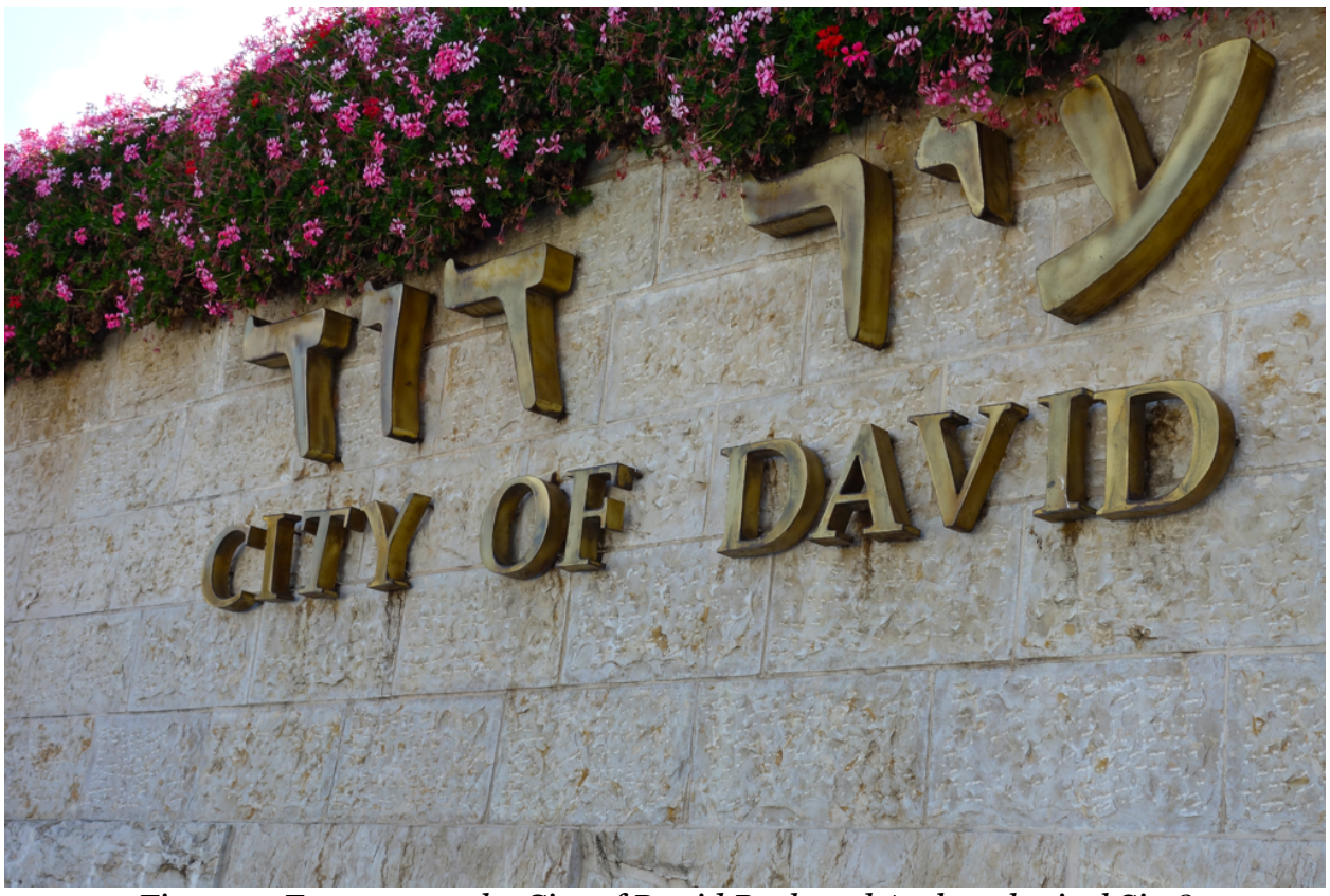
Figure 5. Entrance to the City of David Park and Archaeological Site8

Further to the south of the Ophel site is an area that has come to be known as the "City of David," the place where Jerusalem began. Because it is located within the mostly Arab neighborhood of Silwan, part of the West Bank, control of the City of David is a delicate issue between Israelis and Palestinians.