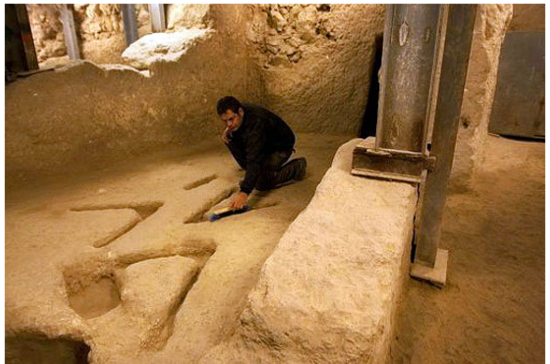
Figure **. Eli Shukron examines mysterious markings in ancient worship site21

Mysterious markings in one of the rooms have been the subject of much speculation, and even a request to the public for help in identifying the markings.22 Are they symbols, Hebrew letters, or purely of a functional nature? Although the response was overwhelming, nothing conclusive has been deduced.